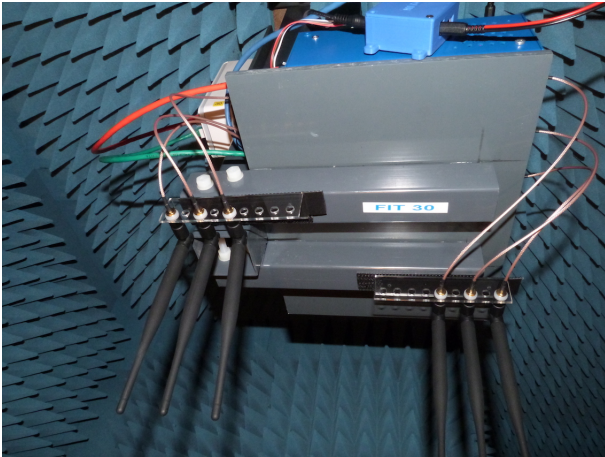
Figure 3: Wi-Fi dual-band antennas for a node

To control and monitor each Icarus node, we use the NITlab's Chassis Manager Card (called CM card); this device embeds a tiny web server that can serve http requests to power on/off and reset the motherboard, or one attached USB device.